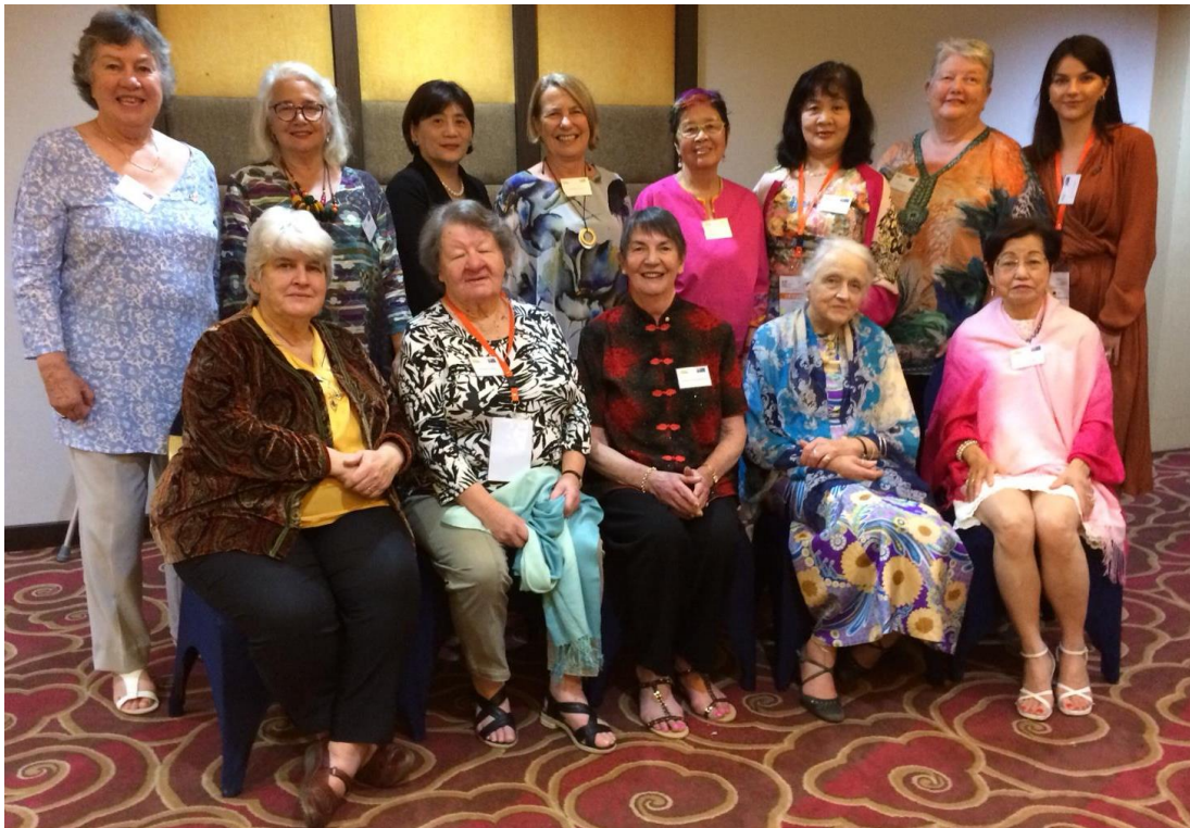
The Australian Delegation at the Conference Dinner