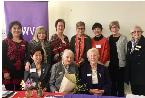
NCWV Committee of 2019-2020