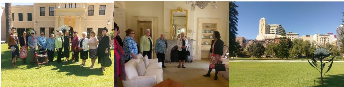
Left to right: (L) Members of NCW SA at Government House with Mrs Lan Le, our Patron-In-Chief (second from left) in the Gardens of Government House. (M) Mrs Lan Le addressing the NCWSA members in one of the private sitting rooms. (R ) The view of Adelaide city from the gardens of Government House.

Members of the N.C.W. SA Executive and long-time members of the organisation were invited by our Patron-in-chief, Mrs Lan Le to morning tea at Government House on Friday October 11 th , 2019. Mrs Lan Le welcomed NCWSA and was gracious in her address to us regarding the work of NCWSA, our affiliated organisations and her belief that our good work continues to be important in the wider community.