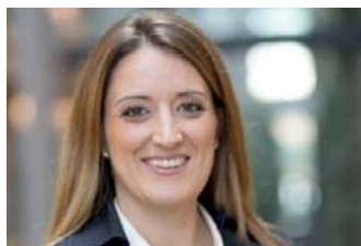
Roberta Metsola, President of European Parliament

National Council of Women of Malta congratulates Hon. Roberta Metsola on her appointment as President of the European Parliament in January 2022. We are greatly honored that an NCW Malta member has reached such a high position in the European Union. Indeed, the results of the elections reflect the trust members of the EU Parliament have in Roberta Metsola.